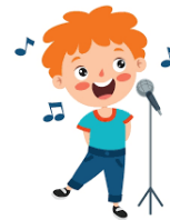
4) Yusuf (4pts)